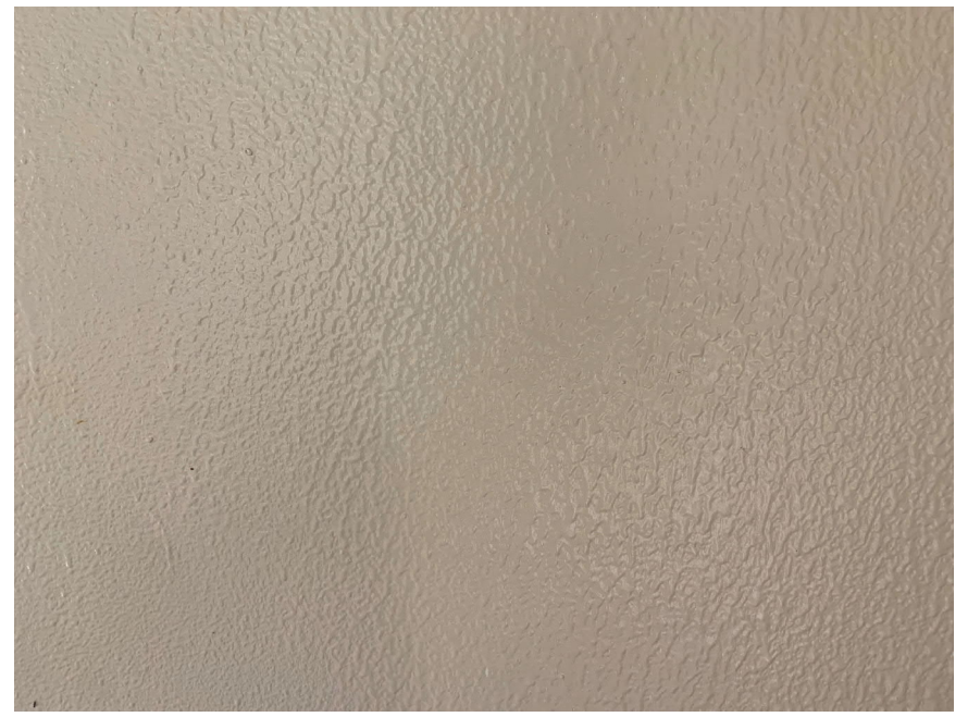
<u>Photograph No. 2</u> HA-04: White Wall Texture