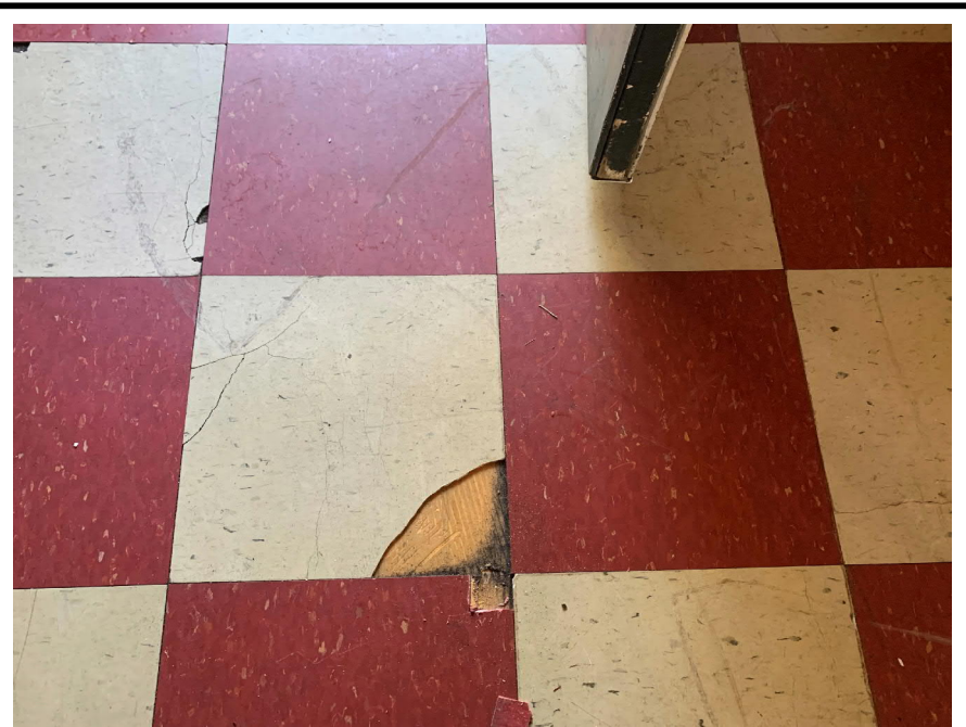
Photograph No. 1 HA-01: Red 12"x12" Floor Tile & HA-02: White 12"x12" Floor Tile