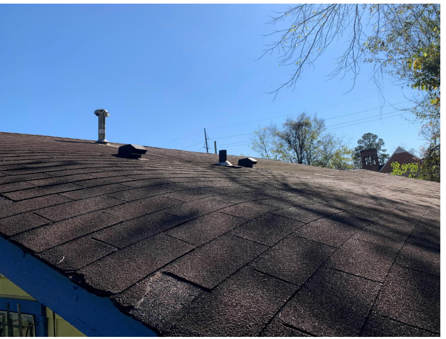
<u>Photograph No. 6</u> HA-09: Black Roof Shingles