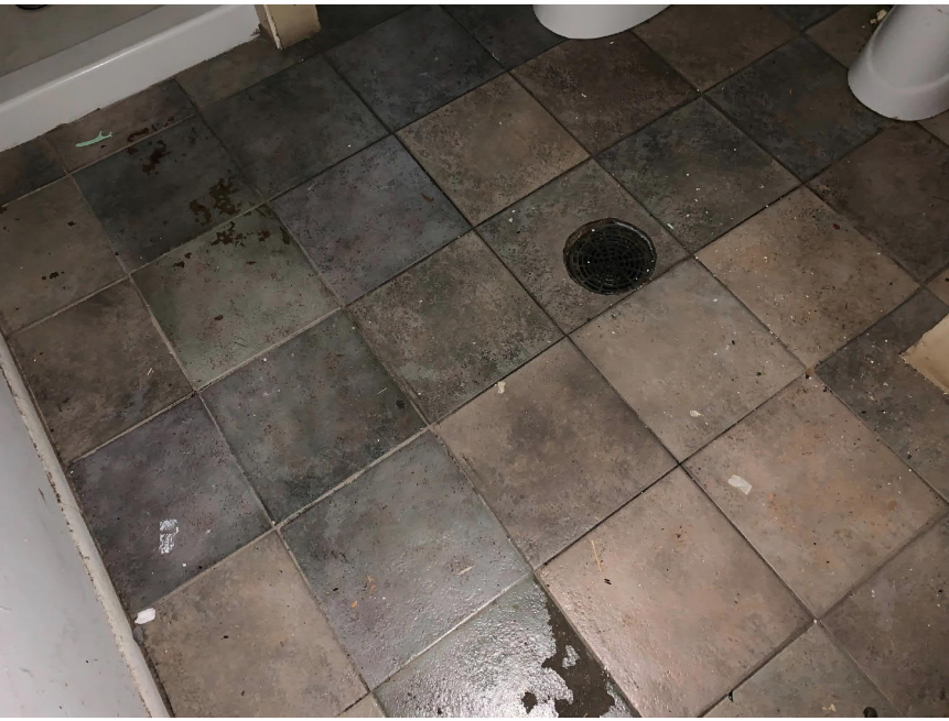
<u>Photograph No. 5</u> HA-07: Gray/Brown Ceramic Floor Tile with Gray Grout