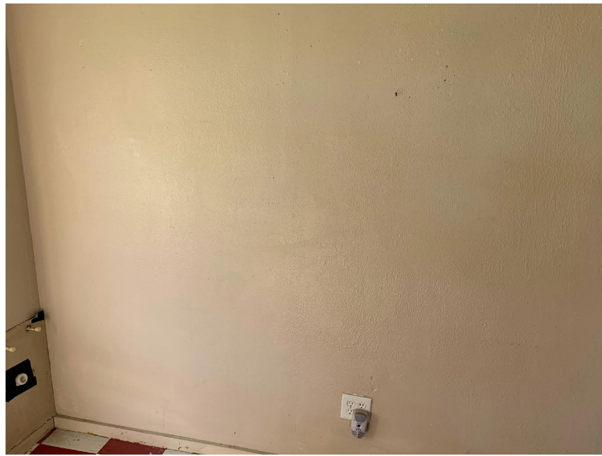
Photograph No. 3 HA-05: White Wallboard with Joint Compound